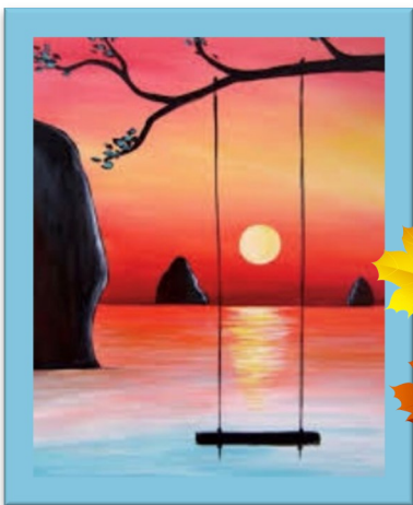
Acrylic Class w/Corinna 9/14 from 10a-12p $25