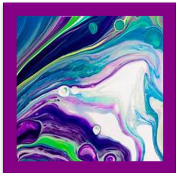
Acrylic Pours w/Julia 9/24 from 3p-4p $15